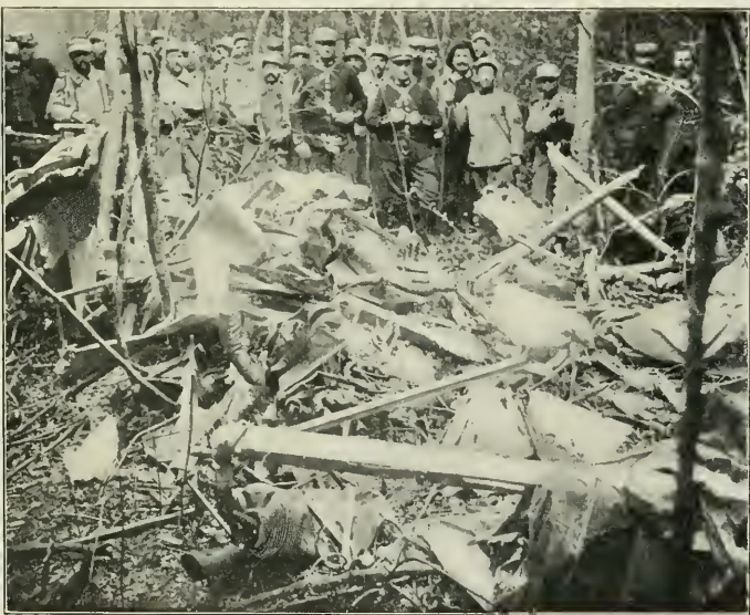
THE DÉBRIS OF A FALLEN GERMAN AEROPLANE